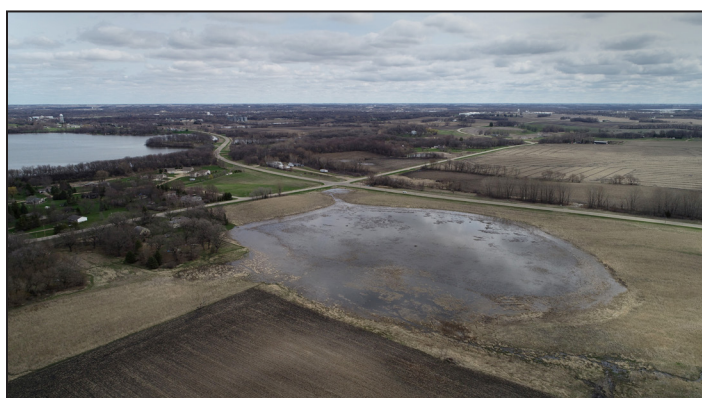
Top: An image from spring 2020 captured part of what is now the 245-acre Pickerel Lake WPA. Above: The SRRWD will transfer the 45-acre site it purchased for $273,000 with Outdoor Heritage Funds in June 2018 to the DNR, which will add the restored wetland to the Upper Twin Lake WMA. The transfer is expected to be finalized this summer.

“ We’re trying to build on complexes, kind of create that functioning prairie within the ag landscape. ”